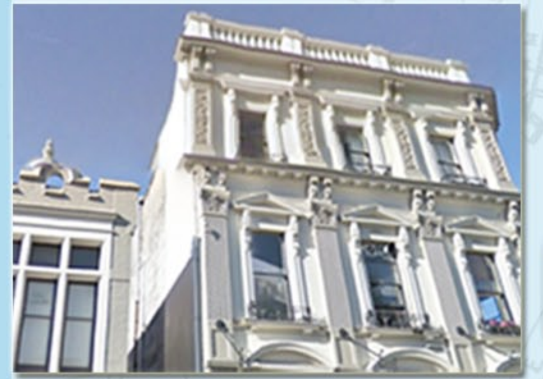
Stop 3: 145 Stuart Street