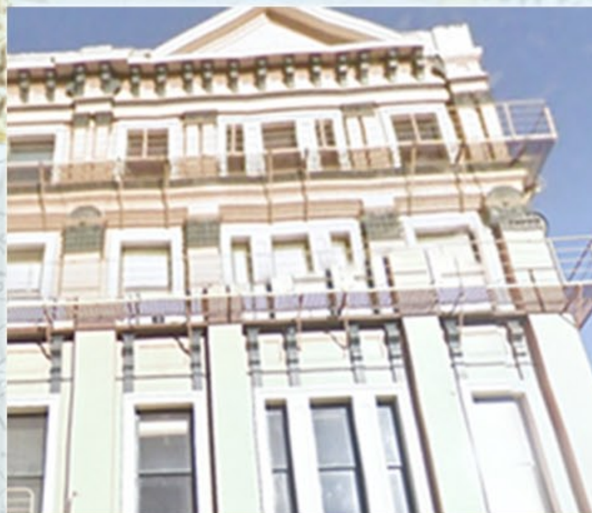
Stop 6: 152 Princes Street