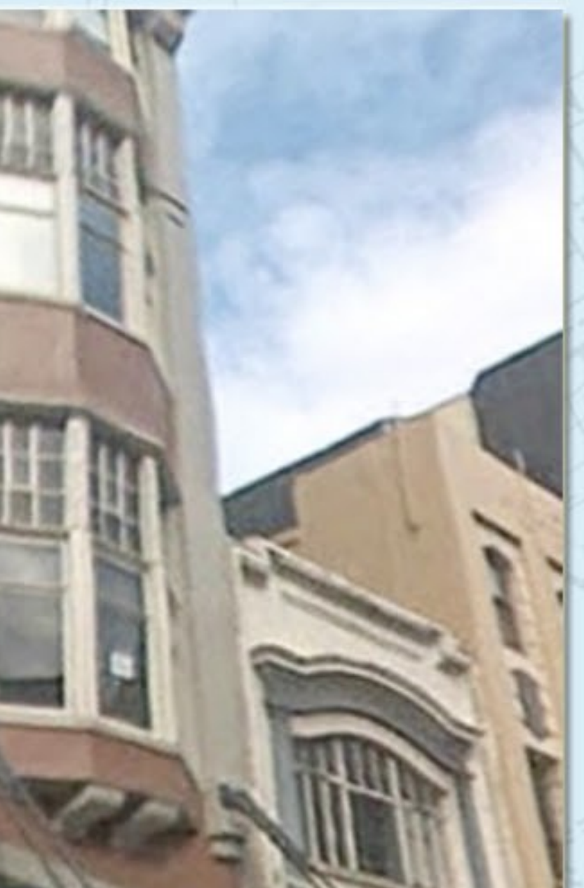
Stop 4: 67 Princes Street