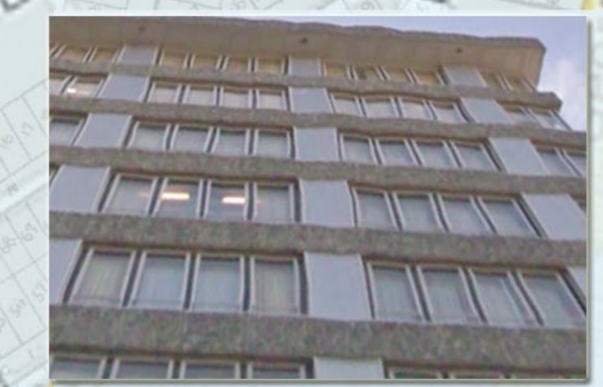
Stop 5: 141 Princes Street