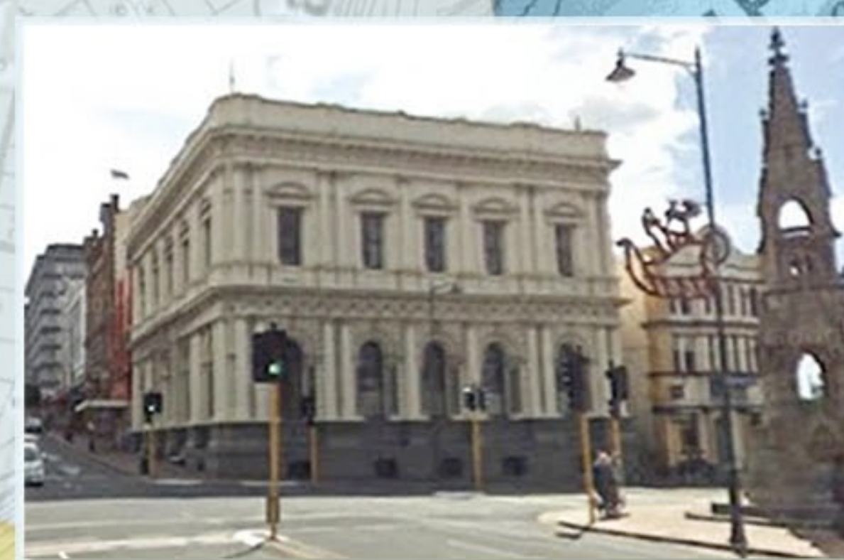
Stop 9: Cr Princes and King Sts